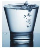
E) a full glass of water

2. The raw sap contains water and mineral substances that are absorbed by the plant. The direction of their flow through the woody tissue of the plant is: