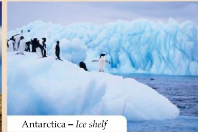
Antarctica – Ice shelf