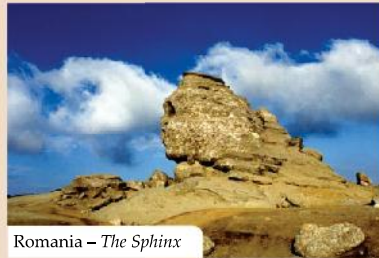
Romania – The Sphinx

Dorin – Romania (temperate-continental climate), Valeria – Antarctica (polar climate), Otilia – Egypt (dry tropical climate), Anton – Brazil (wet tropical climate).