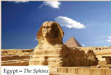
Egypt – The Sphinx