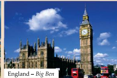
England – Big Ben

21. There is a very small quantity of ... in the desert.